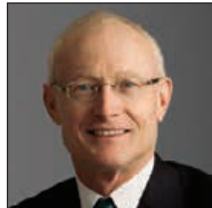
MICHAEL E. PORTER, PhD, Professor, Author and Global Thought Leader, Cambridge, MA