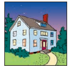
. . . or home