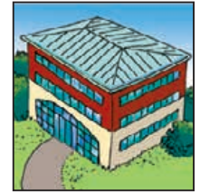
At your office . . .

PROS: Live digital feed and 24/7 Internet access for the next six months; accessible in the office, at home or anywhere worldwide with Internet access; avoid travel expense and hassle; no time away from the office.